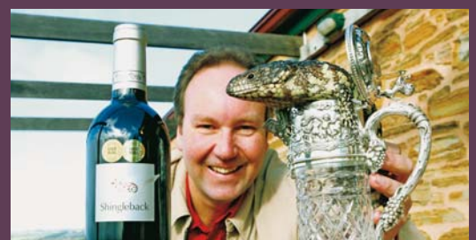
Shingleback wines has won this year's Jimmy Watson. See the full story p16.