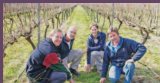
Key players in the viticare native grasses trial at the Goona Warra vineyard site at Sunbury in Victoria. Full details page 19.