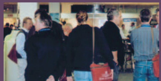
The Winery Engineering Association Conference and Exhibition in Adelaide proved highly successful. Turn to page 60 for more on the conference coverage.